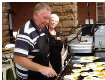
Sunny side up?

A great day at the Army Museum in Fremantle; about 60 Members and Guests joined us. Following a nice breakfast we